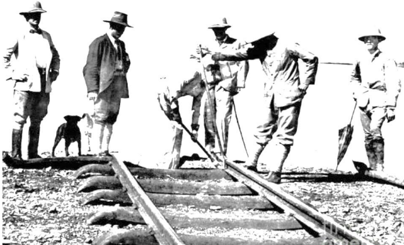
Construction of Uganda railway

. A section of University students from one of the universities in East Africa, College of Humanities, Department of History, have embarked on research in different secondary schools in Uganda. The theme for their research is "Understanding the Economic Impact of Colonialism in East Africa." Some of these students are coming to your school to learn about the features of the colonial economy in Uganda. The History Department has identified you to speak to them.