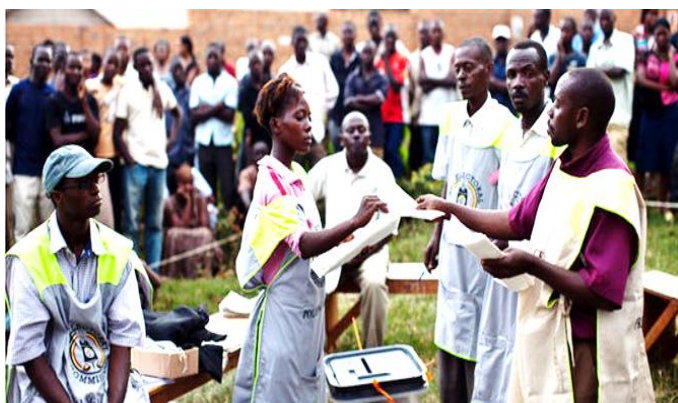
Voting process in Uganda

During the previous local council elections in Uganda, it was reported that voter turnout was significantly low. This was attributed to the fact that a number of people did not value local government systems and felt they were not important. As a result, the ministry of local government embarked on sensitizing the people about them you have identified to be part of the team to address the people in different parts of the country.