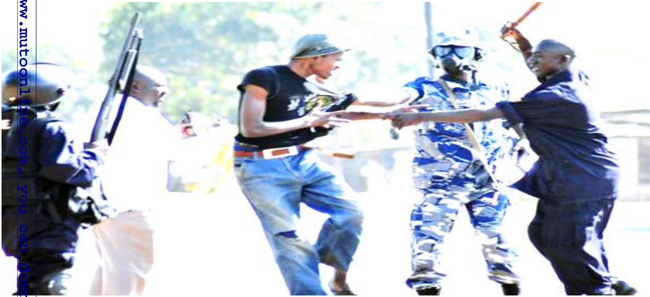
Human rights violation in Uganda

In some African countries, there are rising cases of authoritarianism/dictatorial tendencies, with some leaders attempting to weaken democratic institutions and keep themselves in power. This has attracted the attention of a number of human rights groups and Civil Society Organisations, who have organised regional conferences on democratic governance. You have been identified by one of these organisations to explain the benefits of democracy and inspire citizens to defend democratic values in one of the African countries.