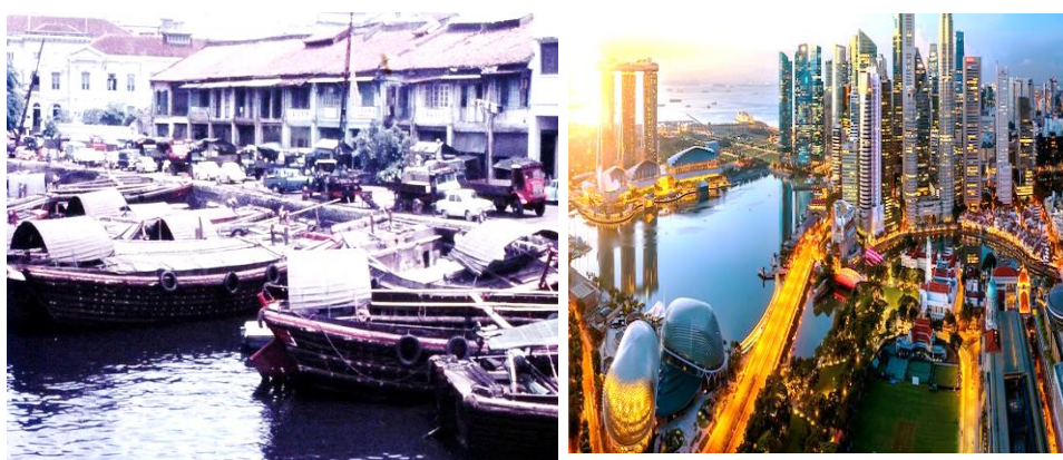
Economic development in Singapore

In the 1950s, South Korea and Singapore were among the Asian countries labeled as least developed. However, today, they have achieved significant economic growth and development, earning them recognition as highly developed nations. The remarkable progress of these countries has captured the interest of many leaders in East Africa. And would like to elevate their economies to the level and status of South Korea and Singapore.