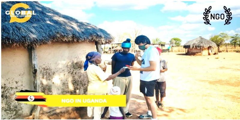
Non-government organization at work in Northern Uganda