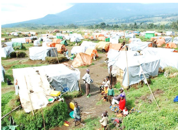
A refugee camp of internally displaced people