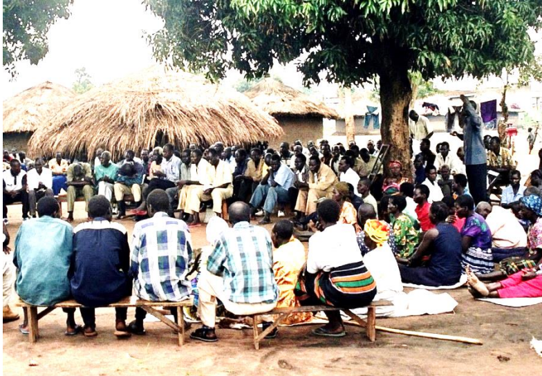
A traditional village meeting