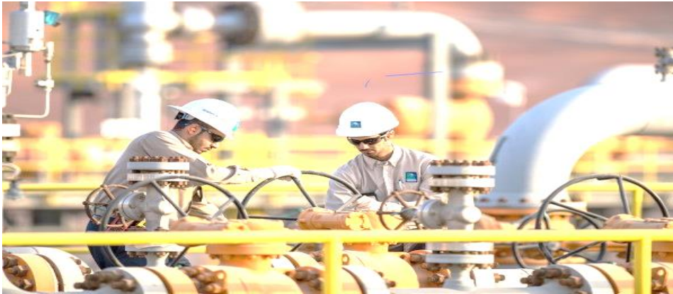
Multi-national cooperation in E.A

The MNC pays minimal taxes to the local government, employs few local workers and contaminates the Environment, causing health problems for the nearby communities. Meanwhile, Uganda is heavily indebted to the wealthy country and is forced to implement economic policies that benefit the MNC, rather than its own citizens.