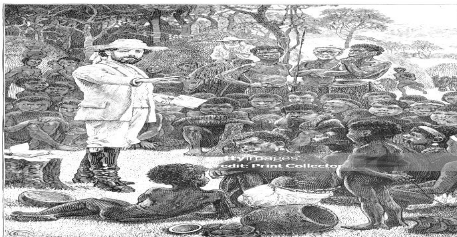
The white missionary preaching to a group of Christians.

A section of the people of Kalongo village are against activities of a Christian religious group from Germany. They petitioned the local government of the area to block its operations in their community citing challenges like noise pollution, fraud by pastors, and spread of gay-related activities among others. However, majority of the people in the area are of the view that despite the above challenges, religion plays a significant role in the development of the community as such, the Christian group should be left to carry out their activities.