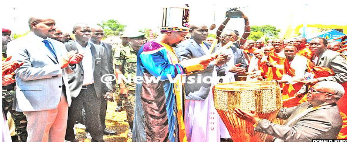
The coronation of the Kyabazinga of Busoga

The people of Bugungu in Busoga sub region have conflicted for a very long time regarding the restoration of their cultural leaders the Ssbabagungu. Majority of the people in the region support his restoration due to the role played by cultural institutions in the economic development. However, there is a section of people who believe that the traditional institutions are a thing of the past without any significant contribution to their community thus see no need if reviving the institution.