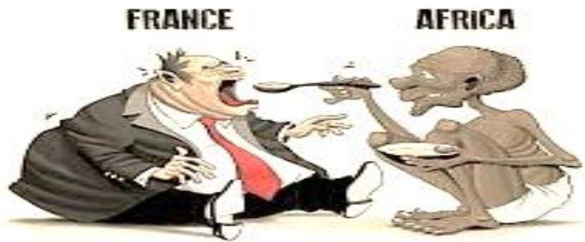
Imperial relationship in Africa

Imperialism where they were theoretically independent but without the political, economic and social liberty.